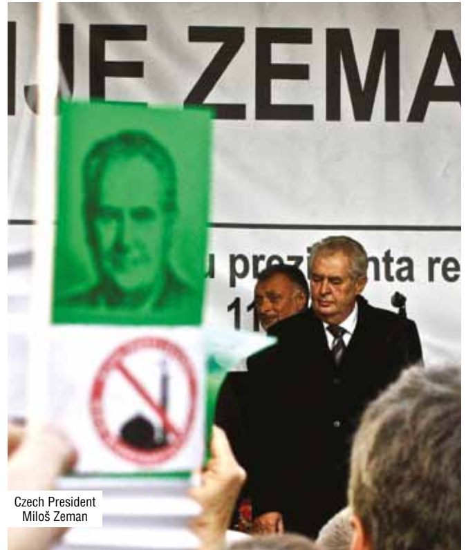
Czech President Miloš Zeman

Since then Zeman's rhetoric has regularly echoed 'counter-jihadist' ideas. In December 2015 he repeated a key CJ trope, stating: 'I am profoundly convinced that we are facing an organised invasion and not a spontaneous movement of refugees'.