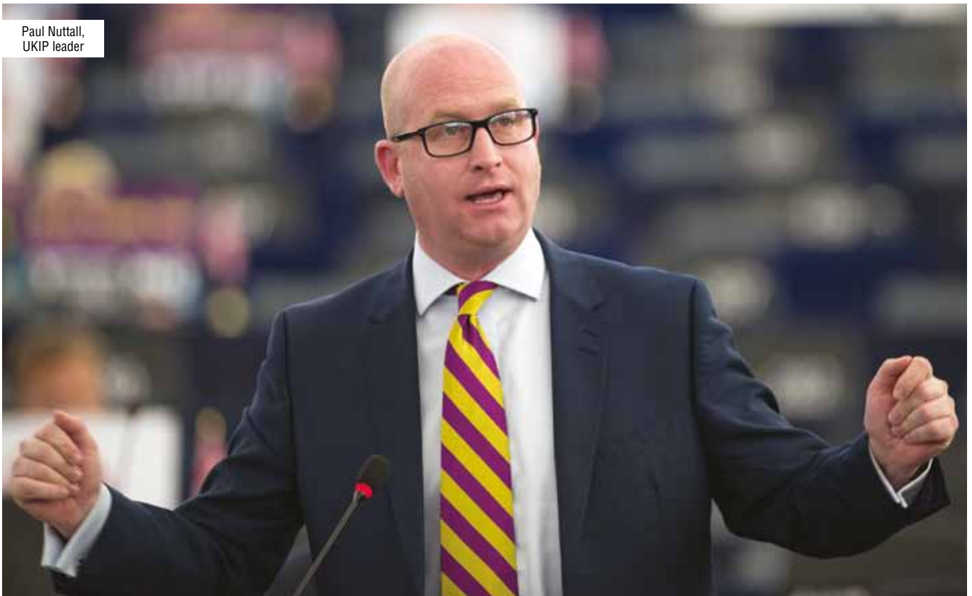
Paul Nuttall, UKIP leader

These are just a few examples of the dozens available of prominent UKIP members articulating 'counter-jihadist'-like views.