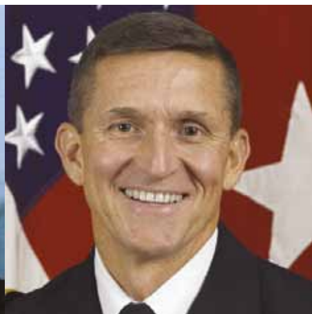
Michael T. Flynn