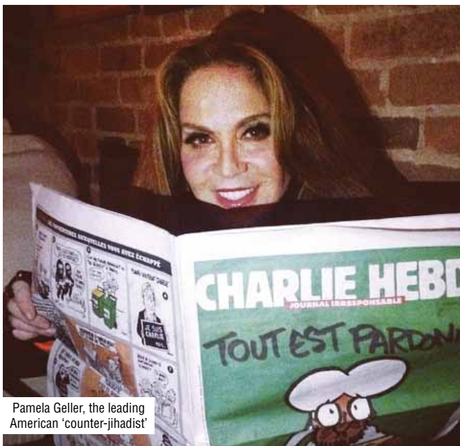
Pamela Geller, the leading American 'counter-jihadist'

While much press attention has rightly noted the manner in which Trump and his campaign have mainstreamed controversial and extreme anti-Muslim figures over the last year, this phenomenon is not new in America. Before exploring Trump's appointees, it is worth noting how over the last 10 years, well before the rise of Trump, 'counter-jihad' activists have slowly been boxing their way out of obscurity and garnering increasing levels of influence.