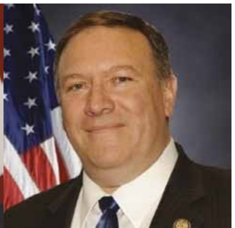
Rep. Mike Pompeo