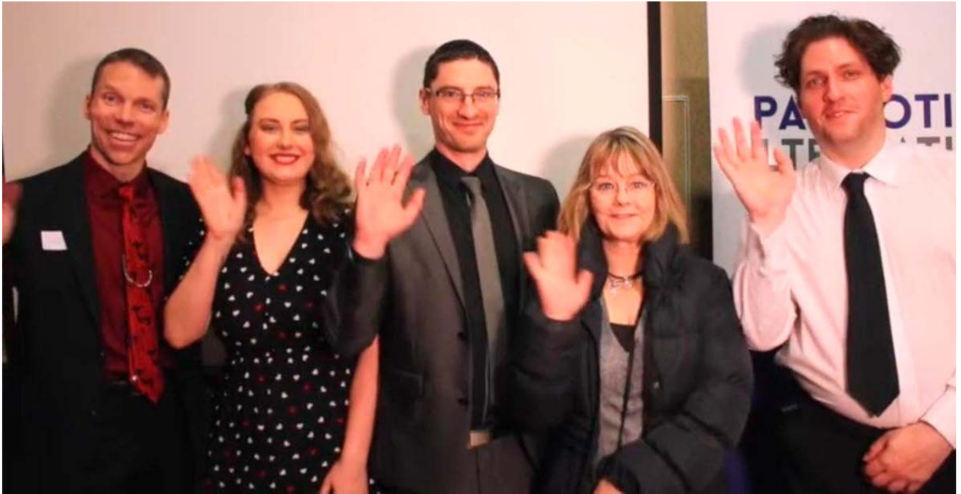
Patriotic Alternative conference speakers March 2020

(Halal and) Kosher slaughter in their manifesto, it is replete with antisemitic tropes. In a nod to conspiratorial ideas of Jewish control, they state that: “Never should a foreign power be allowed to unduly influence the way that the British state conducts its affairs. Equally, no minority should ever be allowed to wield disproportionate power over the British people or hold disproportionate influence over or within the government.”