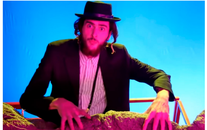
An antisemitic caricature in an unaired Million Dollar Extreme sketch

Hyde became more widely known due to a 4chan meme that, since 2015, has intentionally misidentified him as the suspected gunman responsible for a variety of mass shootings, such as the Parkland, Las Vegas and Orlando shootings, and many more. In May 2022, the shooter who murdered 10 people in an anti-Black racist attack in Buffalo, New York included pictures of Hyde in his manifesto, labelling them "recent self pictures".