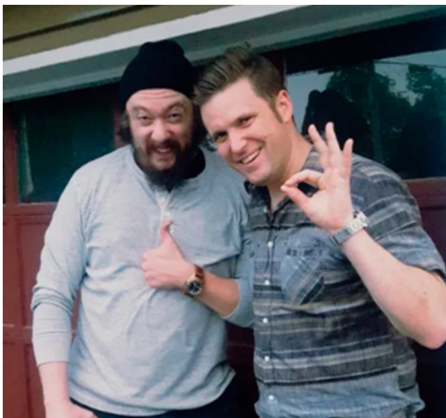
Sam Hyde (left) and Richard Spencer, the figurehead of the alt-right

The fight featured on the latest " influencer boxing " event streamed by the sports platform DAZN. This trend is bringing some of the world's best known social media figures into the ring, selling out arenas and making hundreds of thousands of pay-per-view sales in the process. The August event, headlined by the British YouTuber KSI, reportedly broke into DAZN's top five most watched boxing events.